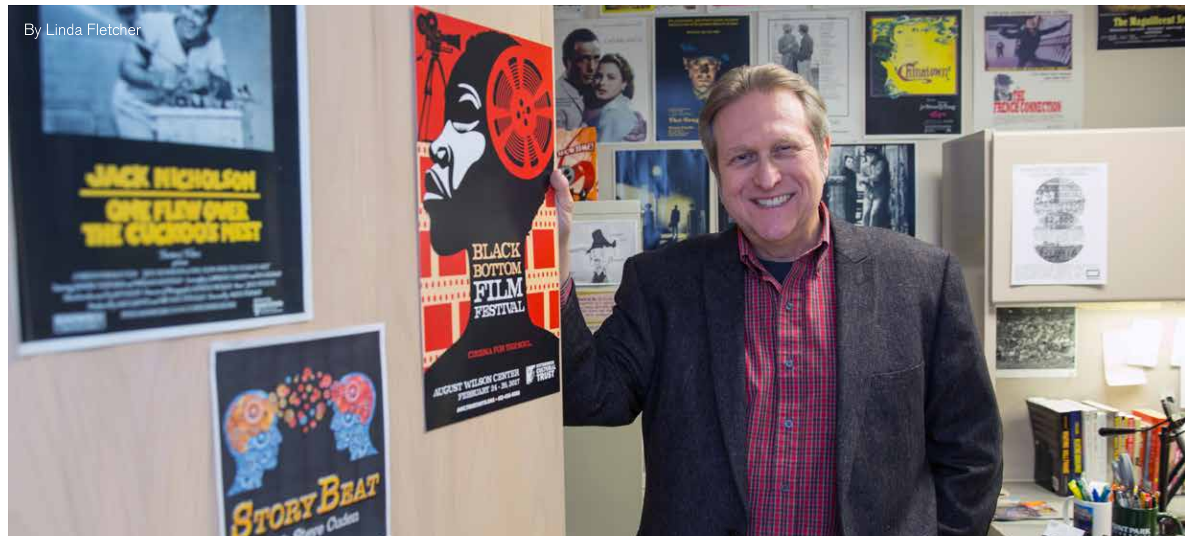
By Linda Fletcher

It's all about the structural elements you need in order to construct the story of a screenplay or libretto. It's more about storytelling than it is about the literal mechanics of